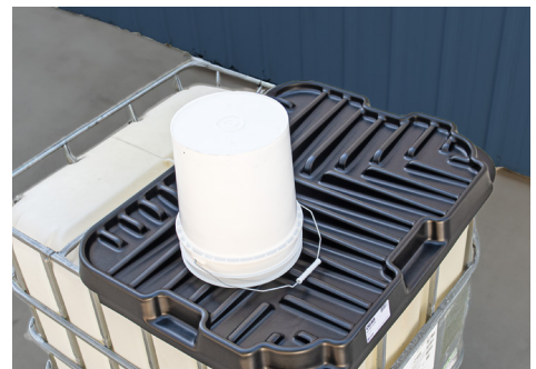
Containers can be placed on top for passive draining